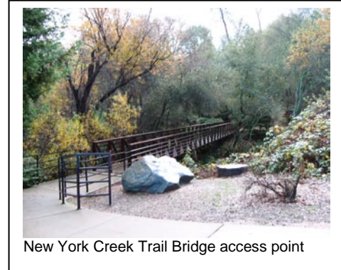
New York Creek Trail Bridge access point