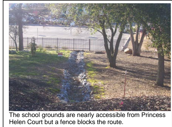
The school grounds are nearly accessible from Princess Helen Court but a fence blocks the route.