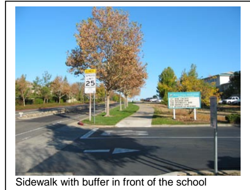
Sidewalk with buffer in front of the school