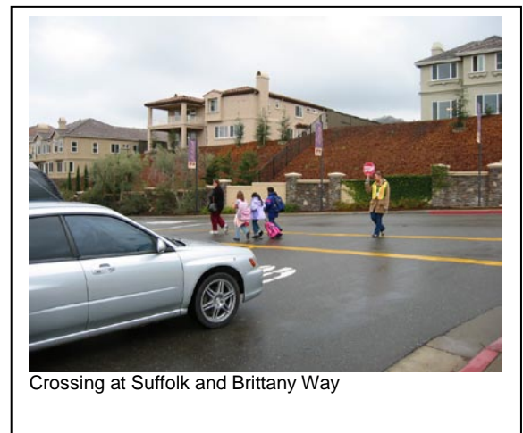
Crossing at Suffolk and Brittany Way