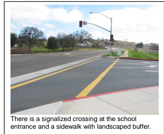
There is a signalized crossing at the school entrance and a sidewalk with landscaped buffer.

The audit was conducted during the afternoon drop off in September, 2007. Due to a lack of facilities and somewhat remote location of the school a majority of the students are bussed or driven to school. A recently constructed sidewalk (October 2008) along Green Valley Road between Bass Lake Road and the future Silver Springs Parkway site next to the school provides a safe passage for the children who currently walk to and from school. Four-foot shoulders and Class II bike lanes also exist on Green Valley Road from the School east toward Cameron Park Drive. The school has a bike rack, which typically has about fourteen bikes and approximately 20 students walk or ride skateboards on any given day. The school frontage has wide sidewalks with a buffer from the road and a signalized crossing. In time, as development occurs and the new Silver Springs Parkway is developed, this school will become more pedestrian and bike friendly.